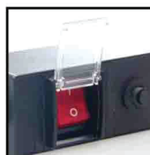
Lighting Switch w/Guard