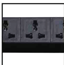
Universal Outlet w/Eye Shutter