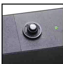
Overload Protection w/LED Indicator