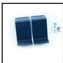
PDU Bracket Kit for Vertical Mount