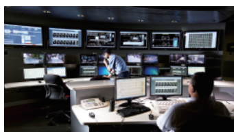
Command and control center