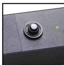
Overload Protection w/LED Indicator