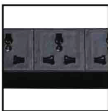
Universal Outlet w/Eye Shutter