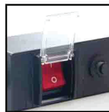
Lighting Switch w/Guard