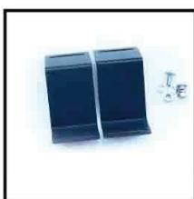
PDU Bracket Kit for Vertical Mount